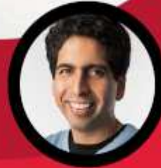
Sal Khan FOUNDER OF THE KHAN ACADEMY