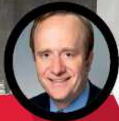
Paul Begala POLITICAL ANALYST AND COMMENTATOR, CNN