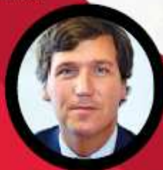
Tucker Carlson CO-HOST, FOX AND FRIENDS WEEKEND AND EDITOR-IN- CHIEF, THE DAILY CALLER