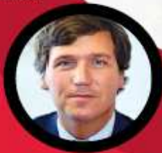
Tucker Carlson CO-HOST, FOX AND FRIENDS WEEKEND AND EDITOR-IN- CHIEF, THE DAILY CALLER