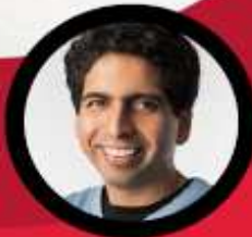
Sal Khan FOUNDER OF THE KHAN ACADEMY

BACK BY POPULAR DEMAND! Experience the SHRM Annual Conference & Exposition with your fellow chapter members. Join us in Washington, D.C. for two and one-half days of learning, networking and fun.