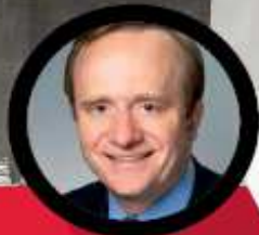
Paul Begala POLITICAL ANALYST AND COMMENTATOR, CNN